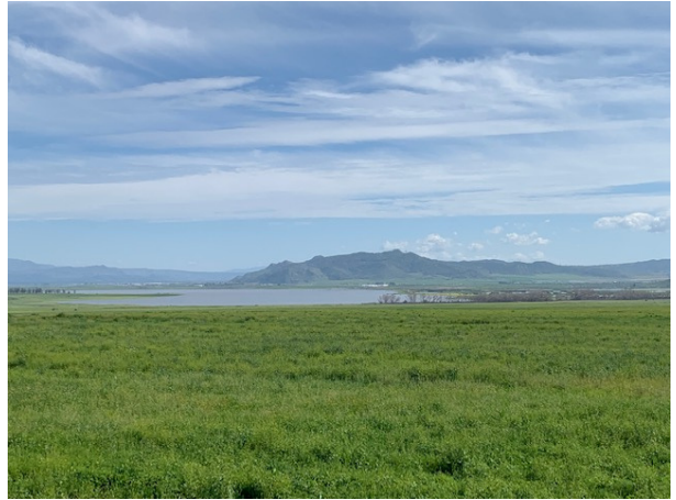
Mystic Lake, San Jacinto Wildlife Area

Another Win—Villages of Lakeview--Denied: The California Fourth District Court of Appeal rejected the environmental impact report for the project in their ruling at the end of March. The Villages of Lakeview project would have put 8,700 homes on the southern boundary of the San Jacinto Wildlife Area, a state-owned facility managed by the California Department of Fish and