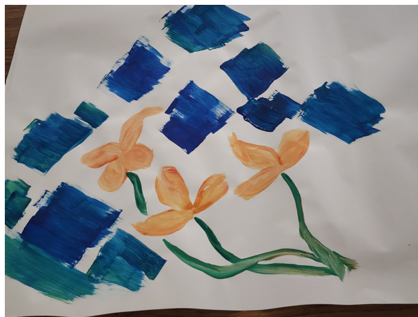
Poppies, surrounded by warehouse buildings.

Using heart-filled messages, words and art, folks shared their reasons for being involved in the environmental movement and Sierra Club's mission to enjoy, explore, and protect.