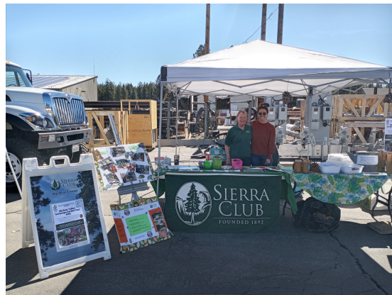
Big Bear Group at Earth Day Event

Our Executive Committee (ExCom) election results found everyone remaining on our board. Here are the official positions for 2023: